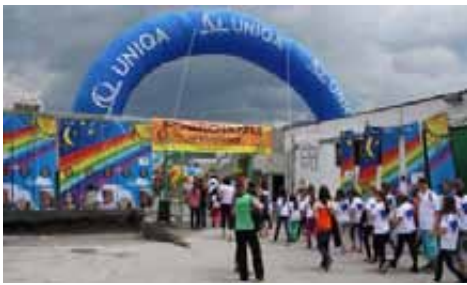
UNIQA provided the insurance for all visitors – and a very cute workshop together with the “Teddy Bear Hospital” team.