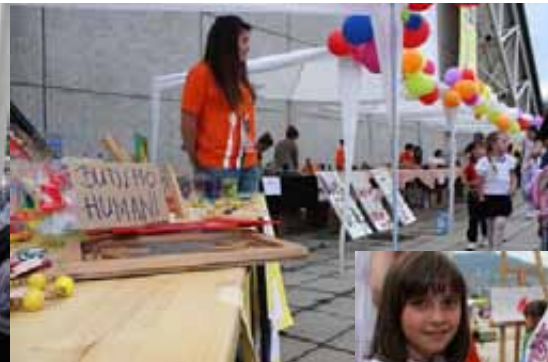
SUMERO FOUNDAT ION & partner organizatio ns from all over BiH