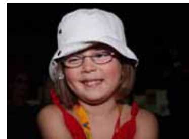
MY SPECIAL GUEST FROM GERMANY

The transport effort was supported by the European Union, UNICEF, the EUPM assisted by the local police institutions, the ICRC, the local Red Cross, and many LOCAL MUNICIPALITIES. Under the umbrella of the EUPM, Police officers from both entities chaperoned children's groups to the festival.