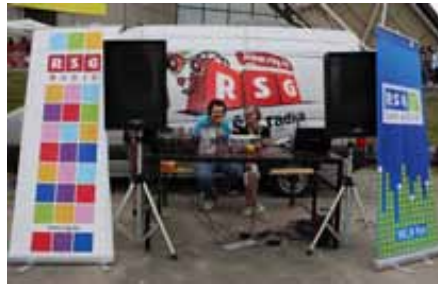
RSG – RADIO DAY top entertainment