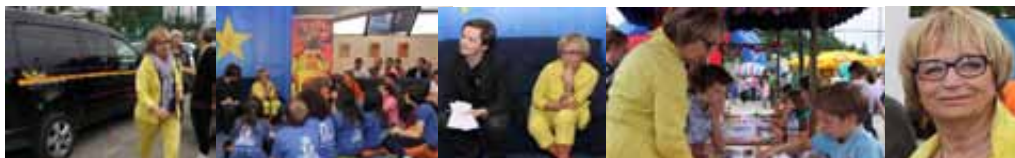
First Honorary Kid's Festival Ambassador Doris Pack

The Kid's Parade, third year, was a sparkling highlight: Sarajevo changed atmosphere, photos from the top of skyscrapers show that twice as many people participated - a happy "walk to Europe" with a very informal received opening by the EU delegation in front of the BBI centre, including the EU anthem performed by a Boys Choir from Phoenix, USA. Not only the Capital of BiH turned "alive": many, many MUNICIPALITIES , for the first time have planned a year ahead financial funds to pay bus transport for children from their towns and villages. Mayors accompanied children's busses, schools from all over Bosnia & Herzegovina – most still financed by international donors and the EU – but nevertheless many, finally, were self-financed. An indicator of local support and acceptance of Kid's Festival in the Federation as well as in the RS . The children's voice has power and finally got to the ears of the ruling parties, in many places they have been heard. To be continued.